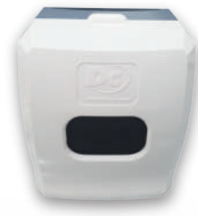
Model: DC Pop Up Dispenser