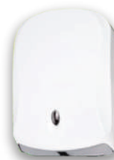
Model: HT Big