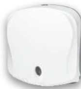
Model: HT Small