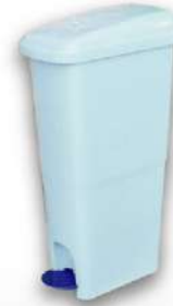
Model: DC 1800