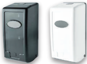
Model: HBT - Wall