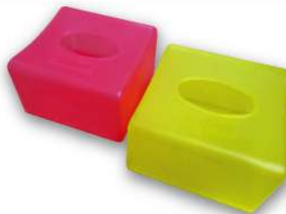
Model: Pop Up Dispenser