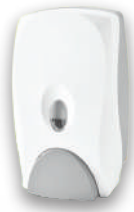
Model: AR 800 (800ml)

Manual Soap Dispenser - Liquids Gel / Foam / Mist Spray