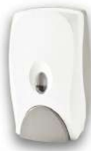
Model: AR 800 (800ml)