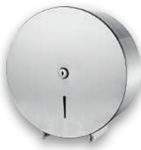
Model: P OBIO-JRT S/S

Stainless Steel Jumbo Roll Tissue Dispenser