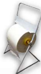
Model: IRT Stand