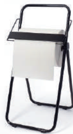
Model: IRT Stand