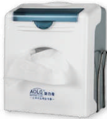
Model: Pop Up Dispenser with compartment