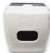
Model: DC Pop Up Dispenser