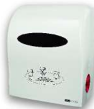
Model: HRT Auto Cut