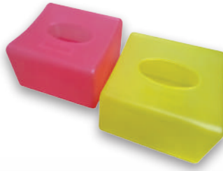
Model: Pop Up Dispenser