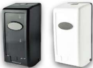
Model: HBT - Wall