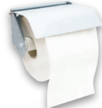
Model: TRH - 1500/SS

Stainless Steel Small Toilet Roll Tissue Holder