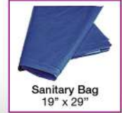
Sanitary Bag 19" x 29"