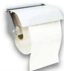
Model: TRH - 1500/SS

Stainless Steel Small Toilet Roll Tissue Holder