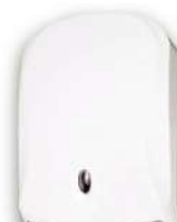
Model: HT Big