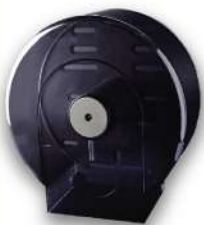
Model: JRD Center Lock