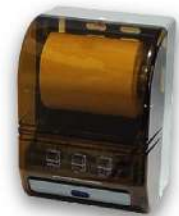
Model: HRT Auto Sensor