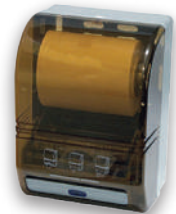
Model: HRT Auto Sensor