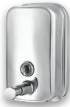
Model: BQ 101 (800ml)

Stainless Steel Soap Dispenser - Liquids Gel