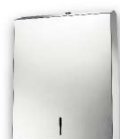
Model: P OBIO-S/S DIS