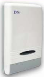
Model: 5 Fold HT