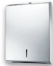
Model: P OBIO-S/S DIS