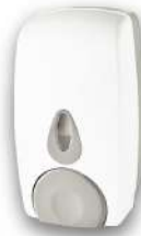
Model: AZ800 (800ml)