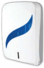
Model: 5 Fold HT