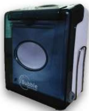
Model: Pop Up Dispenser with compartment