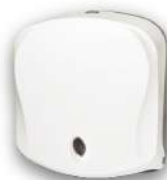
Model: HT Small