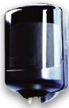
Model: CFTD - Tiger