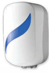
Model: CFTD - Tiger