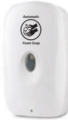
Model: AR1133 (1000ml)

Auto Sensor Soap Dispenser - Liquids Gel / Foam / Mist Spray