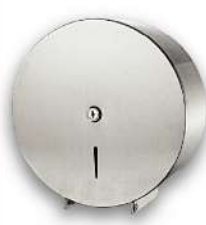
Model: P OBIO-JRT S/S

Stainless Steel Jumbo Roll Tissue Dispenser