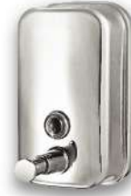
Model: BQ 101 (800ml)