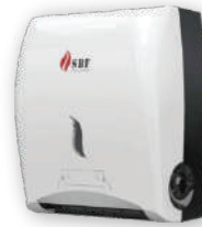
Model: HRT Auto Cut